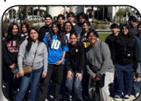
Students at the Belmont Amusement Park located in Mission Beach