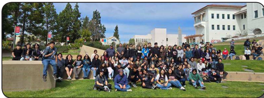
SDSU San Diego Campus