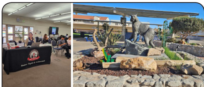
Matriculation and Core Services